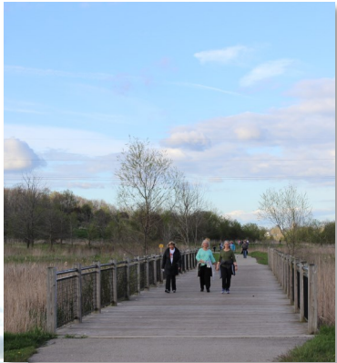
Upper Macatawa Natural Area 1300 84th Ave Zeeland, MI 49464