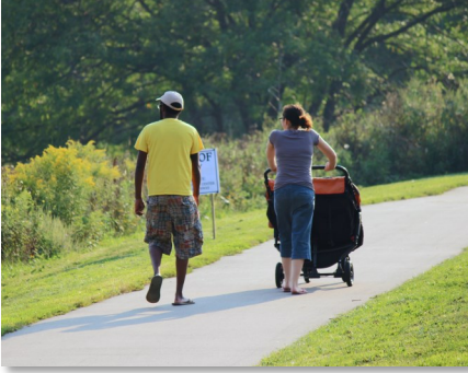
Paw Paw Park-East 1230 Paw Paw Dr Holland, MI 49423