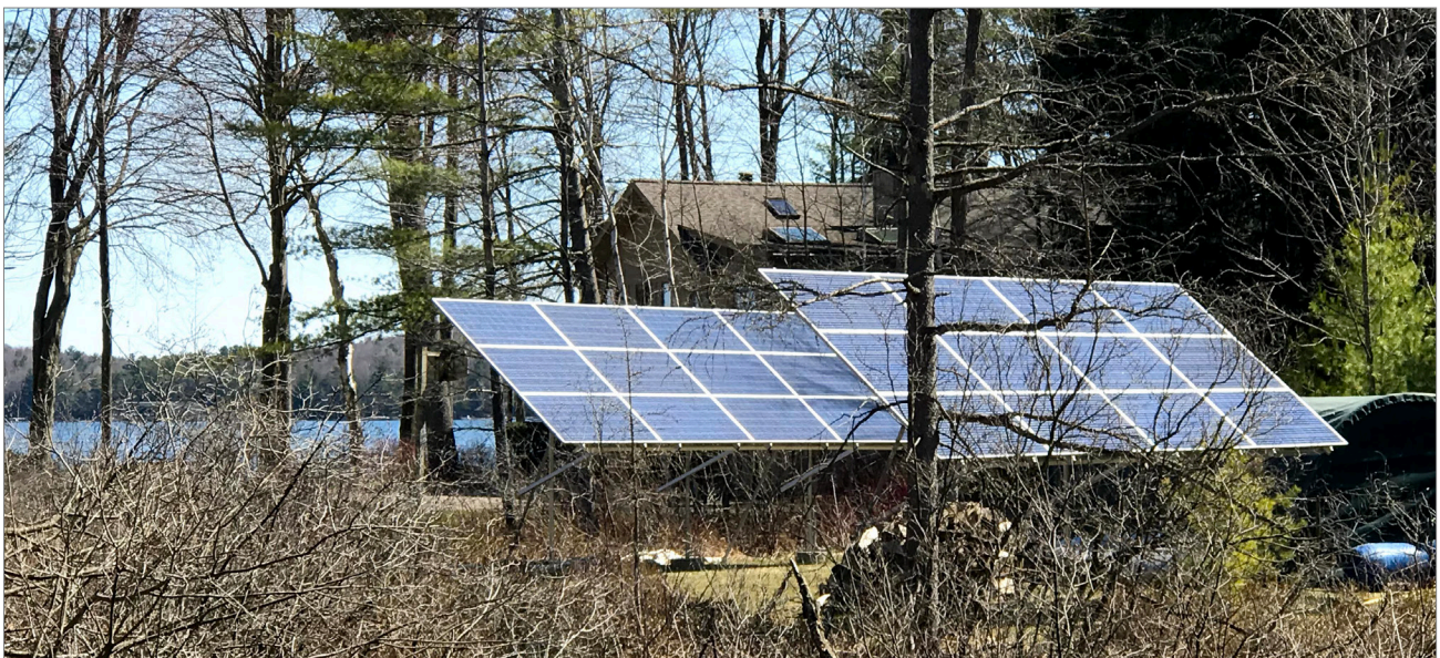
Ground-mounted SES, Grand Traverse waterfront.

Preparing a zoning ordinance and master plan are only two aspects of being solar-ready. More information on how communities can plan for, regulate, and reduce barriers for SES—through meaningful public engagement, clarifying building/electrical permit processes, reducing permit fees, and evaluating placement of SES on or near municipal buildings, to name a few—is available through numerous Michigan agencies, universities, and organizations, and through the SolSmart 5 program. Additional resources on solar energy (and renewable energy) planning and zoning in Michigan are available from MSU Extension 6 and the Michigan Department of Environment, Great Lakes, and Energy 7 in partnership with University of Michigan Graham Sustainability Institute 8 faculty.