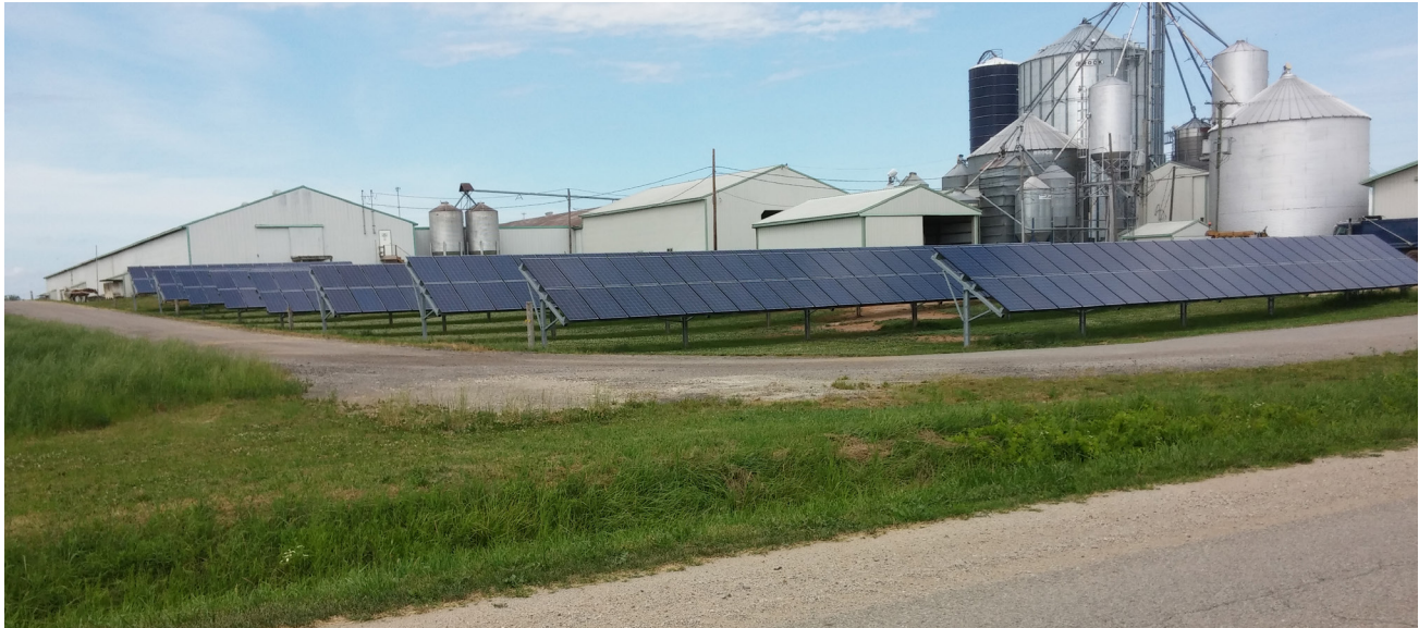
Langeland Farms SES.