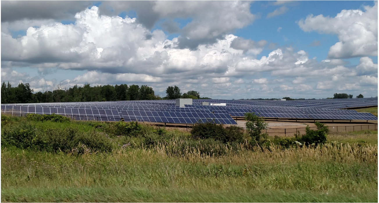
Lapeer Solar Park.

Michigan's diverse energy future is set in motion. Utility companies have bold plans to expand solar options and other forms of renewable energy over the next two decades and beyond. By 2040, DTE Energy 1 expects to have over 10 million solar panels generating power for its customers. Consumers Energy also announced 2 plans to build roughly 8,000MW of solar energy by 2040. Regional electric cooperatives and municipally owned utilities are following suit, with plans to expand solar energy production. Michigan has 65 utilities across two peninsulas.