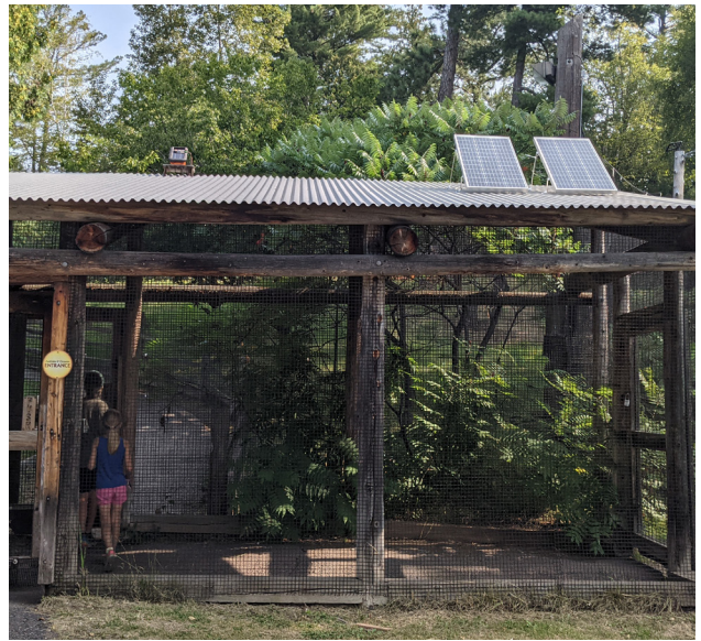
(Clockwise from top right) Ground-mounted SES with grazing (sheep) by Mary Reilly; park outbuilding, rooftop SES in winter, demonstration array, all by Bradley Neumann.

In this guide, the scale threshold between small and large principal-use SES is 2MW (or approximately 20 acres). Currently, there are dozens of SES projects of 2MW and less being developed in the state. 35 These have largely been well-received by local communities, suggesting they fit within the character of the landscapes in which they are proposed. Small systems 2MW or under (or 20 acres) could be permitted by right after an administrative site plan review (see discussion below). Each community, though, should