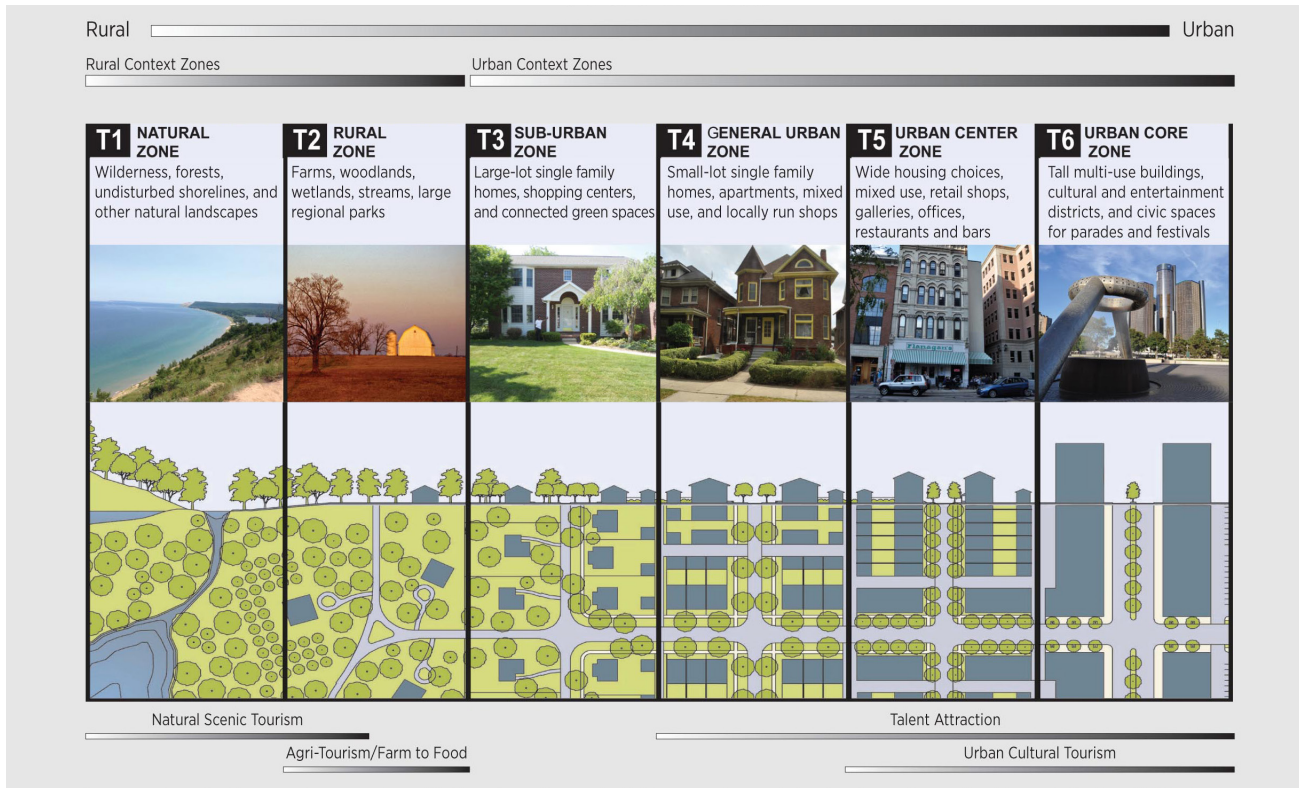
Fig 1. Rural-to-Urban Transect. Credit: DPZ CoDesign; MSU Extension

From left to right in Figure 1 , above, the landscape shifts from a natural zone (T1), which can be wilderness, woodlands, wetlands, or other naturally occurring habitats, gradually transitioning in intensity-of-use to the urban core where we find our large urban centers. The remaining transect zones depicted in Figure 1 include rural farmland and open space areas (T2), suburban developments (T3) and general urban zones (T4, T5, T6), including traditional walkable neighborhoods and smaller historic downtowns. By taking a transect-based view of a community, policymakers can consider SES scales and configurations relative to the development pattern(s) in a community to determine the most appropriate regulation of SES by landscape type (vs. specific individual land use).