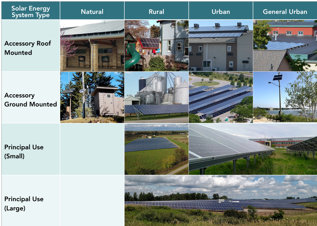
Fig 2. Examples of Solar Energy System Types across the Transect

Figure 2 provides a visual depiction of the type and scale of SES that exhibit predominant factors for compatibility in a given setting. For example, while it's not generally appropriate to develop a large or small principal use SES in a natural wilderness area (T1), it may be more appropriate to allow roof-mounted SES in that transect to serve park structures and accessory equipment within this landscape. Similarly, compatible siting of SES can occur in the suburban transect zone (T3) with a full range of SES types and scales, such as a roof-mounted system on a hotel, an accessory ground-mounted SES carport, or a large or small principal use system at an office park. Regardless of whether a community uses transect-based zoning terminology in the master plan or zoning ordinance, the transect framework is helpful in developing community goals related to the logical placement and installation of SES across varying landscapes of a community.