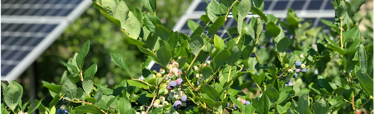
Dual-use ground-mounted SES and blueberry farm.

MICHIGAN EXAMPLES: Many Michigan communities with both small-scale and large-scale solar regulations have zoned on-site solar energy systems as accessory uses. The City of Bay City (Bay Co.), Lyon Charter Township (Oakland Co.), and Almont Township (Lapeer Co.) all permit roof-mounted systems as an accessory use in all districts. Van Buren Charter Township (Wayne Co.), Albert Township (Montmorency Co.), and Chester Township (Ottawa Co.) all expand this provision (e.g. permitting roof-mounted systems as an accessory use in all districts) by permitting both on-site roof-mounted and ground-mounted systems in all districts as an accessory use. [End of example]