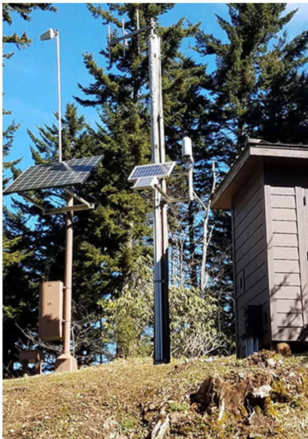
Accessory ground-mounted SES powering remote meteorological and communications equipment.

Incorporating renewable energy into the master plan is a logical place to start before drafting zoning regulations. The MZEA requires that all zoning be based on a plan. The master plan therefore establishes the community's formal policy position on solar energy development. For example, the master plan might set a goal that permits accessory SES throughout the jurisdiction. For principal-use SES, it might define what scale is appropriate as a permitted use (i.e., use by right) or determine appropriateness based on the location of marginal lands, soil types, or steep slopes. It could document community attributes or characteristics that are important to consider and/or protect when siting solar energy development. A master plan ideally includes a spatial analysis of land-use suitability and incorporates community engagement to establish formal guidance for the zoning regulations.