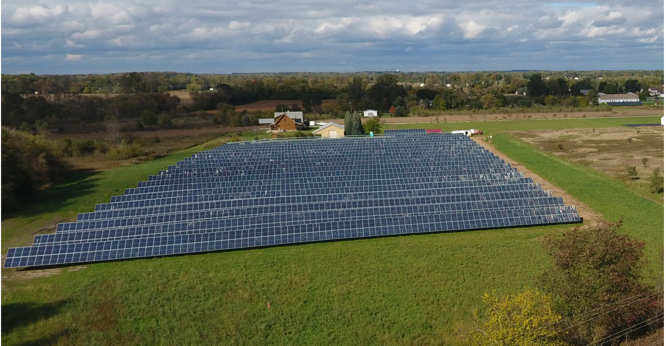
Aerial view of Tecumseh solar farm.

MICHIGAN EXAMPLES: Communities in Michigan have differing approaches to the compatibility of solar energy and agriculture. Here are some examples: