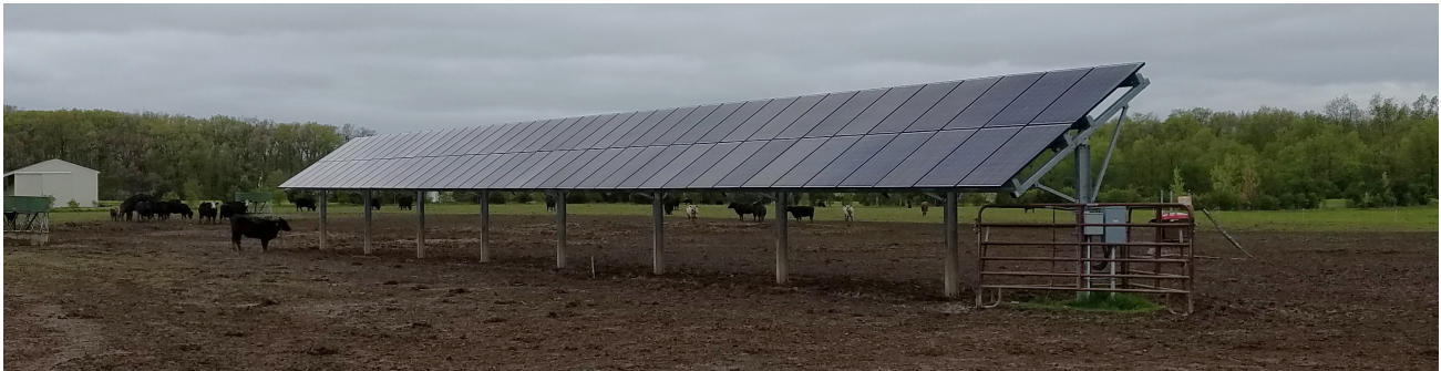
Ground-mounted SES feedlot.

A Roof-Mounted SES, other than building-integrated systems, shall be given an equivalent exception to height standards as building- or roof-mounted mechanical devices, chimneys, antennae, or similar equipment, as specified in Section __ [height exceptions] of the __ [municipality name] Zoning Ordinance. [End of commentary]