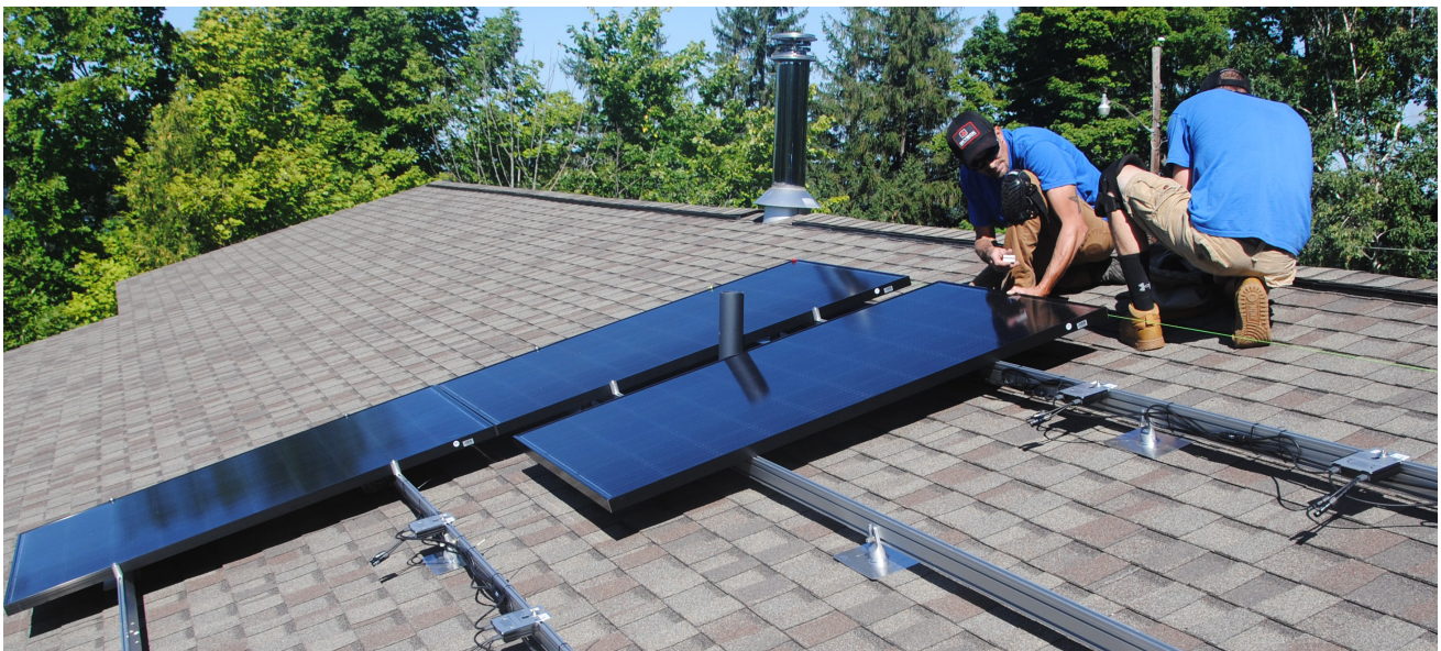
Rooftop SES, Petoskey, Michigan.

It's important to note the distinction between the two primary options at the end of a solar project's life: decommissioning and repowering. Decommissioning is the process of removing the equipment and other infrastructure associated with the project. While decommissioning is commonly a provision in a landowner's agreement with a solar developer, many communities also require review of a decommissioning plan that includes a financial commitment as part of the approval process. The decommissioning plan