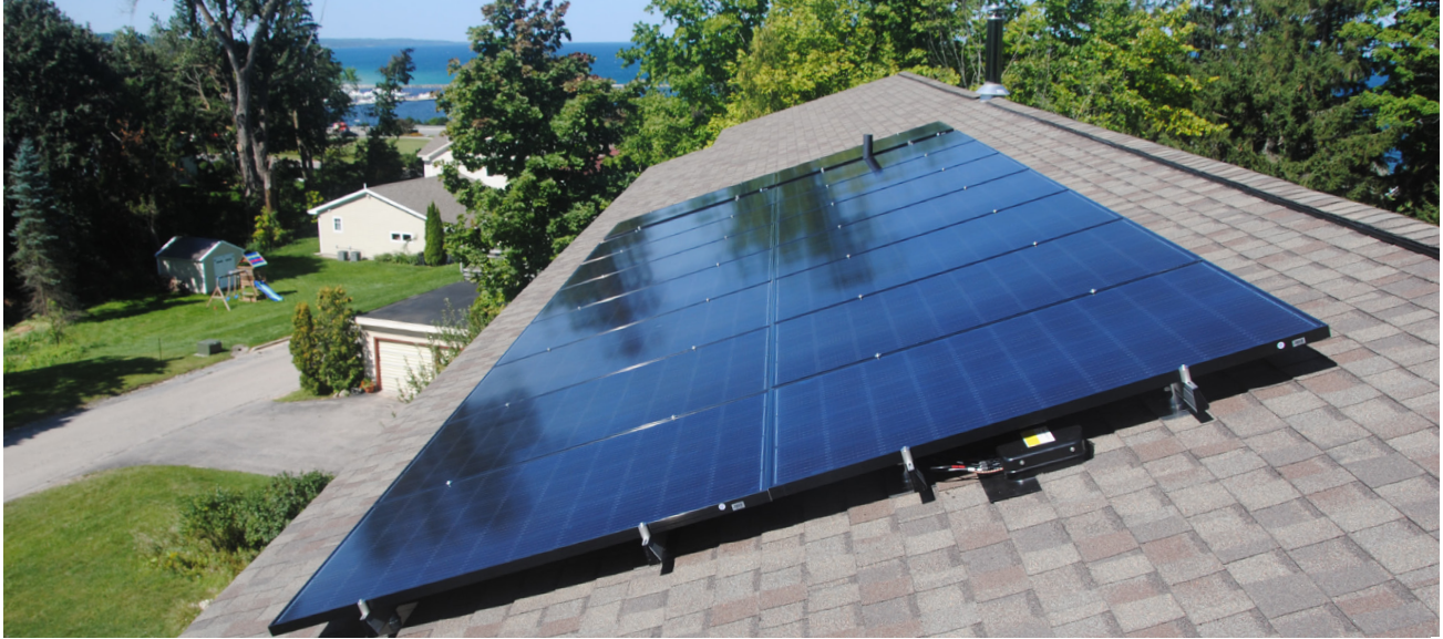
Rooftop SES, Petoskey, Michigan.