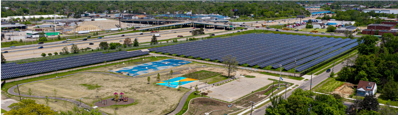
O'Shea Solar Park, Detroit.

While the solar resources in Michigan and other Midwestern states are not as abundant as in the Southwest, 9 over the course of one year, a solar panel in a typical Michigan location produces approximately 70% of the energy as the same solar panel in Phoenix, Arizona. 10 Furthermore, technology advancements have led to rapid cost reductions at all levels of solar development, making solar an increasingly cost-competitive option, both nationally and in Michigan specifically. 11 As a result, utility companies in Michigan have plans to significantly increase the amount of power generated from solar energy. This shift is evidenced by the amount of utility-scale solar energy development currently under construction or in the development queue, 12 along with expanding installations of smaller on-site solar energy systems. 13