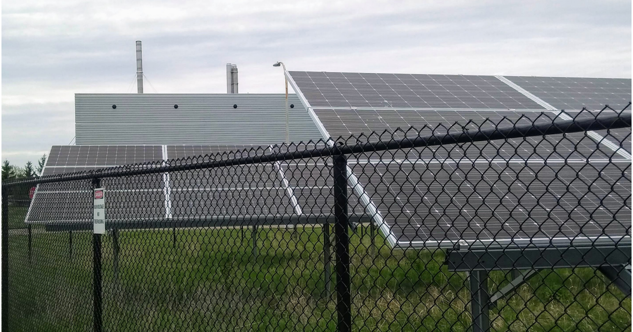
Consumers Energy - Western Michigan University, Business Technology and Research Park solar garden.