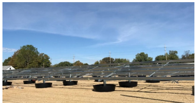
Coldwater Solar Field Park.

For example, parking lots may be outfitted with solar carports as accessory structures (see extended commentary for some case studies). Other examples of co-location of SES include siting solar arrays at public school sites or other institutional grounds and in highway rights-of-way and the open space at airports. With the road network, an SES within a highway or freeway right-of-way might be deployed to power a specific piece of equipment, such as a sign, light, or meteorological station. Given their ample landholdings, airports may be ideally poised for solar installation, and have successfully installed SES as both ground-mounted and roof-mounted systems. The three primary issues regulated by the Federal Aviation Administration (FAA) are reflectivity and glare, radar interference, and the physical penetration of panels into airspace. Guidance provided by the FAA helps airport operators understand the considerations they should make in deploying solar, including when glare studies are required. 60