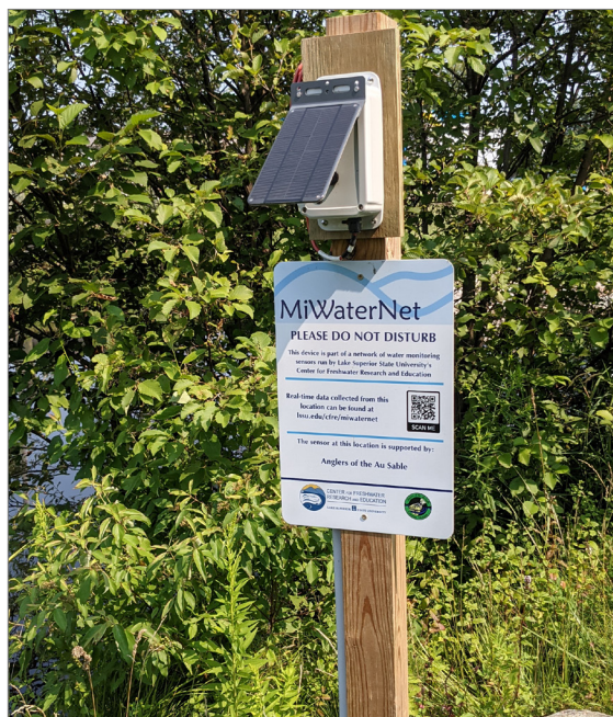
Off-grid device power.