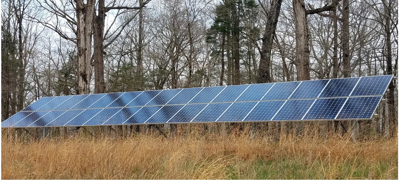
Ground-mounted SES in rural setting.

COMMENTARY: Principal-Use SES may be subject to regulations, such as those of the National Electrical Code (NEC), that require a perimeter fence. The current NEC standards call for a 6-foot fence with three lines of barbed wire, or a 7-foot fence with no barbed wire. A community could ban the use of barbed wire at an SES and still allow for compliance with the NEC, so long as the fencing is allowed to be at least 7 feet. If an SES is not subject to the NEC, wildlife-friendly fencing, commonly made of smooth wiring to prevent injury with openings that allow wildlife to move through, should be used where appropriate. A community may choose to be less prescriptive in fencing requirements so long as the requirements do not conflict with NEC requirements (e.g. by limiting fence height to 5 feet). [End of commentary]