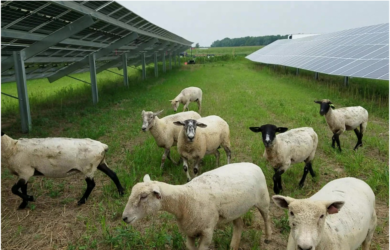
Ground-mounted SES with grazing (sheep).

COMMENTARY: As of January 1, 2021, the sheep and lamb inventory in Michigan was 87,000 head. 52 Of that 87,000 head, 47,000 are ewes. 53 By 2024, there will be a total of 1,188 megawatt (MW) of solar online. 54 Assuming a principal-use SES requires eight acres per MW of generating capacity, 9,504 acres could potentially be grazed. 55 At a stocking rate of three mature ewes per acre, 28,512 ewes would be needed to manage the vegetation of all solar projects currently online or going online through 2024. 56 While there are more than enough ewes to service these solar projects, the sheep inventory in the state is at grazing equilibrium. Solar projects that are suitable for grazing could spur an increase in the sheep and lamb inventory in Michigan. Because ewes can have multiple lambs, the state's sheep industry has the capacity to expand to meet this demand. Furthermore, over half of the lamb and mutton supply is currently imported 57 , and with the largest livestock harvesting facility east of the Mississippi in the Detroit area, there are opportunities to replace imported meat with the increased lamb and sheep inventory. [End of commentary]