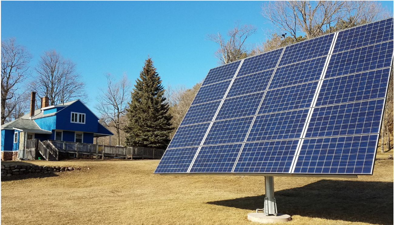
Ground-mounted monopole SES.

This section discusses SES across a range of sizes, scales, configurations, and related components. SES cannot be treated uniformly by local governments because the scale of installations and energy generation capacity can vary dramatically. For example, a small solar panel powering a streetlight might be exempt from regulation, while a large-scale photovoltaic SES, providing power to the grid through a system of components, likely would require rigorous local review.