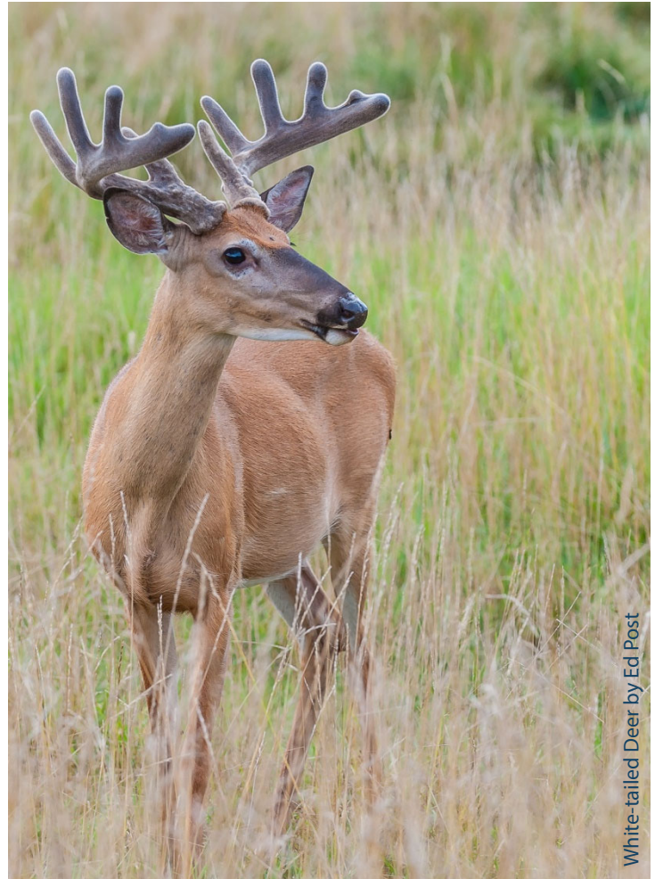
White-tailed Deer by Ed Post