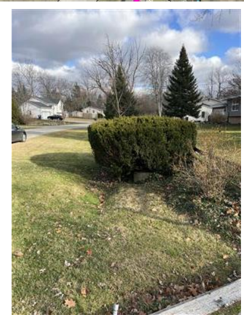
Manhole cover hidden under bush