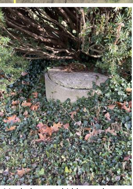
Manhole cover hidden under bush