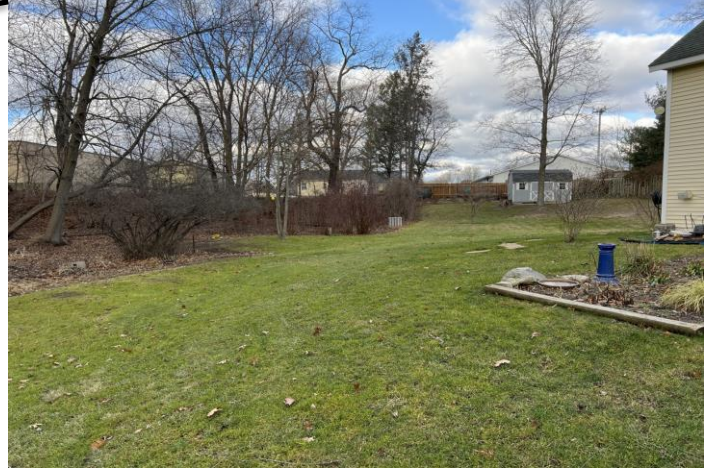
Elevation change causes ponding of water due to poor drainage