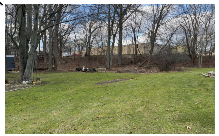
Business district in background drains into backyard, as seen on map