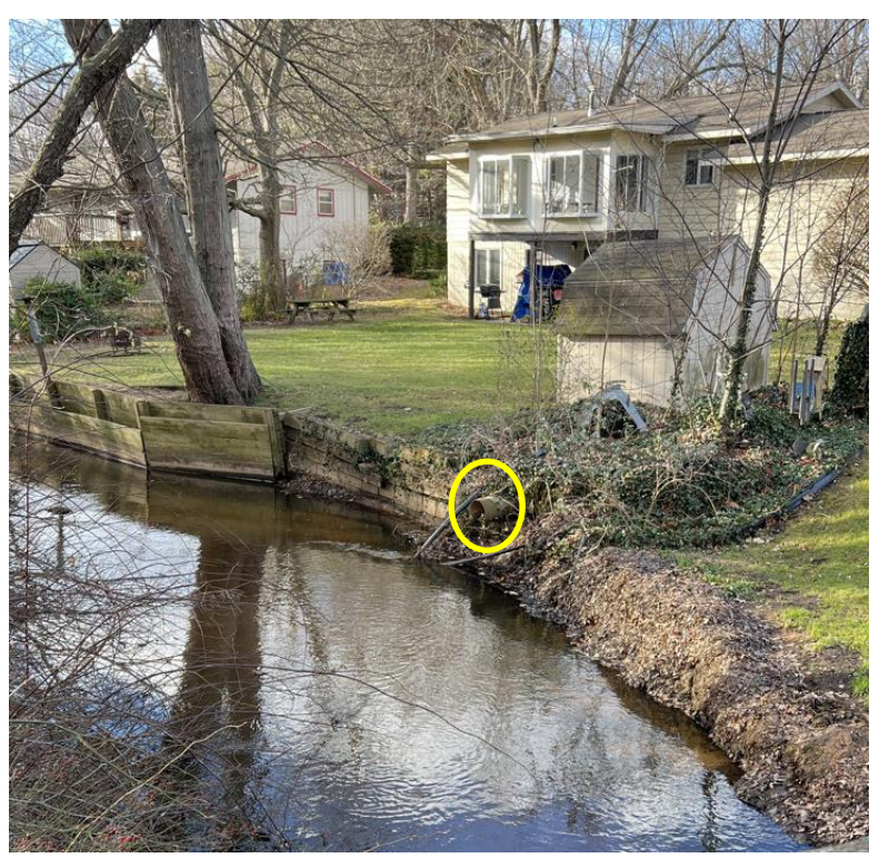
Drain outlet into Harlem Drain