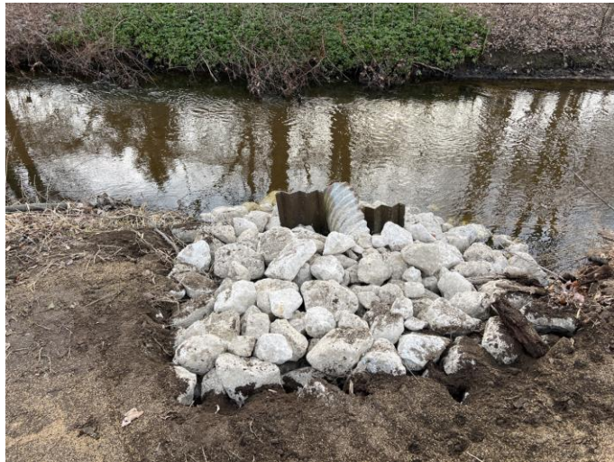
Drain outlet into Harlem Drain.