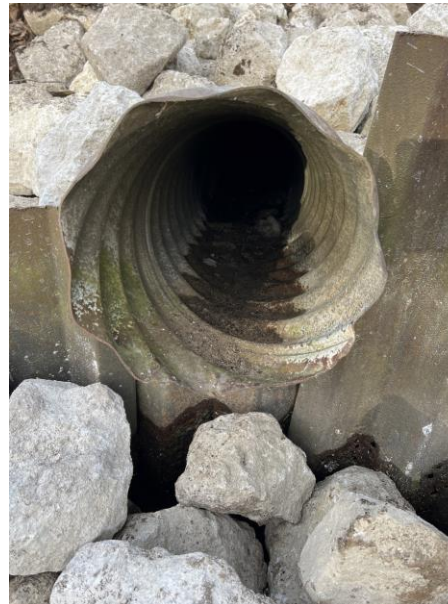
Looking up drain outlet. Outlet is tilted up, above horizontal.