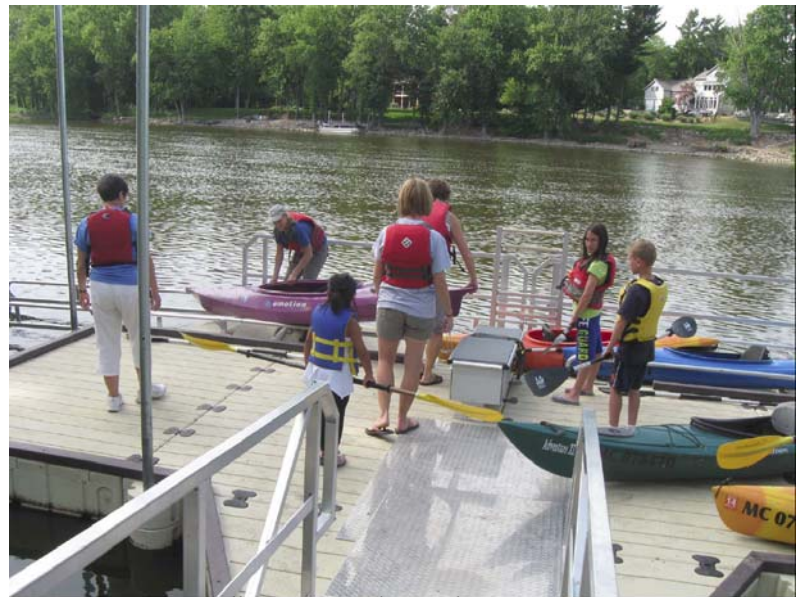
Eastmanville Bayou Kayak Launch

Grand River Accessible Kayak Launches: Through this project Ottawa County Parks will construct and install two barrier-free kayak launch docks at strategic park locations along the Grand River. These launches are unique in that they provide a stable platform to enter and exit canoes or kayaks for novice and/or physically disabled users and assist them in a smooth transition into the water. The two new launches, located at Grand River County Park in Georgetown Township and Connor Bayou County Park in Robinson Township, will supplement an existing similar launch installed at the Eastmanville Bayou County Park site in 2011. Together these three sites will provide an excellent network of accessible locations along the length of the Grand River in Ottawa County for people of various skill levels and physical abilities. Total estimated cost of the project is $95,000 with $47,500 (50%) projected to come from a state grant.